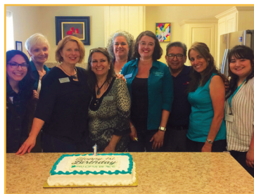
Paloma Place Staff and Interns Celebrate One Year

H appy Birthday to Paloma Place! They recently celebrated their one-year anniversary of providing quality counseling services and support at no cost to the residents of Wilson County and the surrounding area. Paloma Place is the home of the Children's Bereavement Center of South Texas, in partnership with University of Texas San Antonio, and is intended to heal those who have been affected by the Sutherland Springs tragedy, as well as other needs that can impede healthy living and relationships. For more information on Paloma Place please visit PalomaPlace.org . Thank you all for your support!