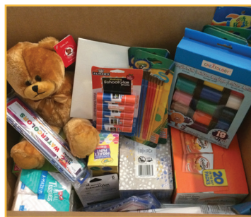
Sweet care package going to El Paso, TX

Though it's still hitting 100° every day, Fall is just around the corner (can you smell the pumpkin spice lattes?) and school is already in full swing, which means the Center is humming with activity! This year we are working with Family Service Association to provide our services to students on school campuses across the city – a collaboration funded by United Way of San Antonio & Bexar County. This unique partnership will take us into five school districts this year and expands our effort to make grief support services easy for students to access – at school where they spend their days. We are incredibly proud of this school-based initiative and grateful for the