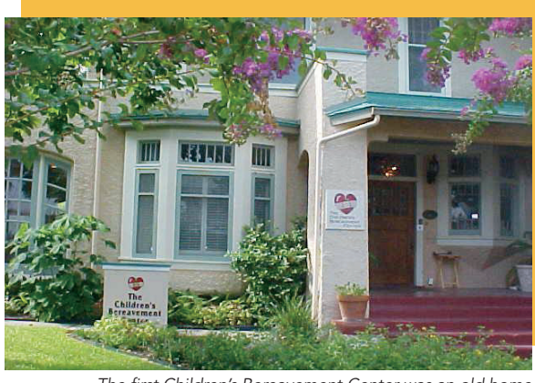
The first Children's Bereavement Center was an old home located on Craig Place.

This year the Children's Bereavement Center is celebrating 20 years of service to the South Texas community – 20 years of providing children and their families with the support and guidance needed to rebuild their lives following the loss of a loved one. We are honored to serve the San Antonio and South Texas area and are looking forward to the next 20 years.