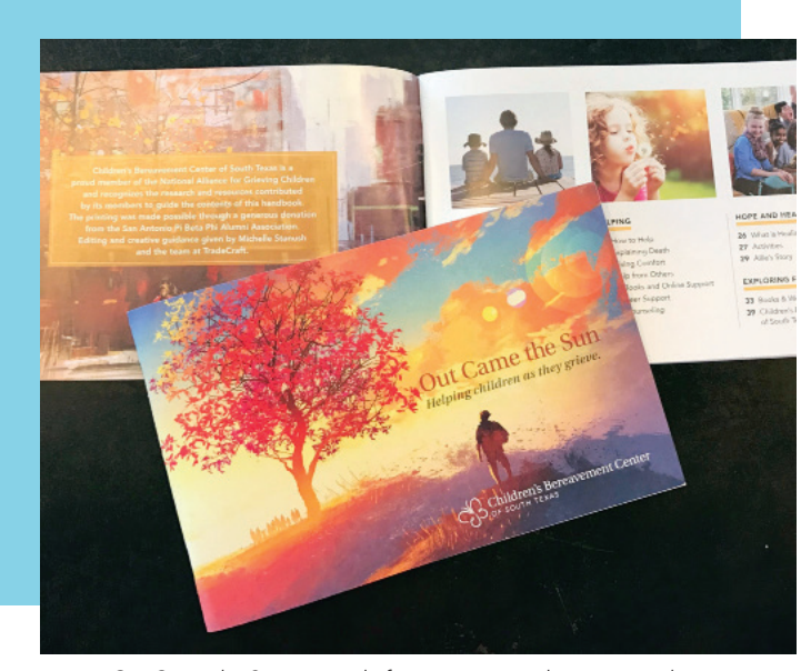
Out Came the Sun is a guide for parents, grandparents, teachers – anyone who may come in contact with a grieving child.