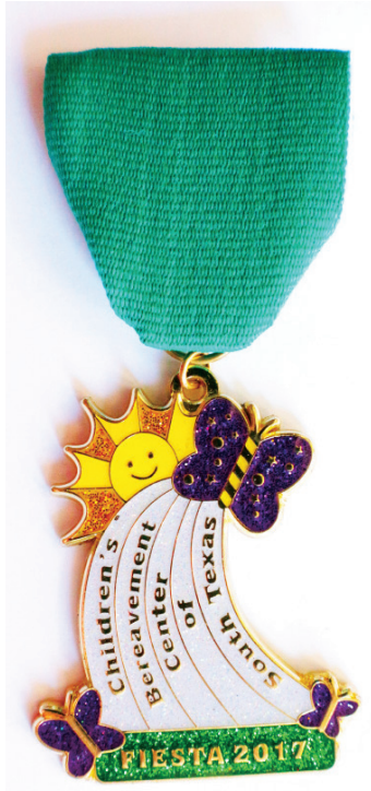
2017 Fiesta Medal