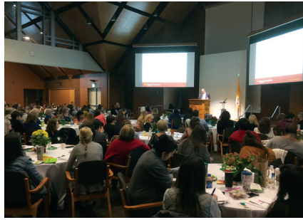
Packed House: Teachers, school counselors, social workers and nurses filled Whitley Theological Center to hear presentations by national experts.