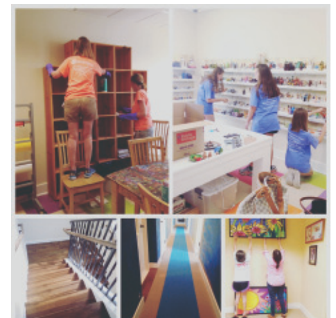
National Charity League

THANK YOU TO National Charity League for helping to freshen things up before groups started this fall.