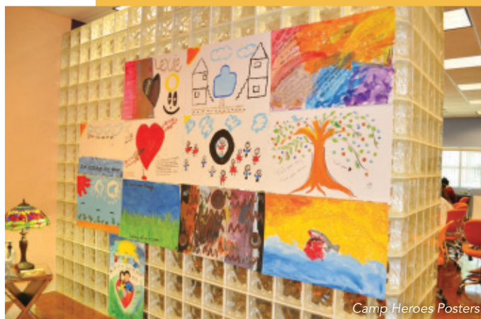
Camp Heroes Posters