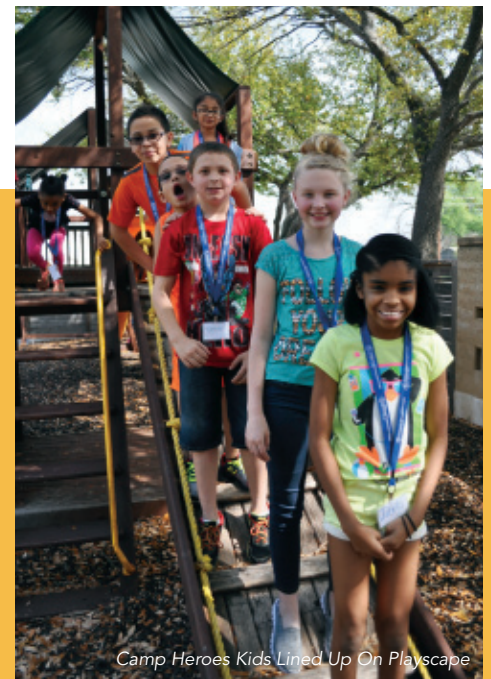
Camp Heroes Kids Lined Up On Playscape

"ALL STAFF WERE SO KIND AND UNDERSTANDING, WHICH IS SOMETHING WE ARE NOT ABLE TO GET FROM OTHER FRIENDS/FAMILY AND PROFESSIONALS. THANK YOU FOR ALL YOUR TIME AND EFFORTS IN HELPING MY FAMILY GET THROUGH THIS DIFFICULT TIME."