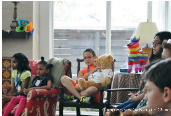
Camp Heroes Girls In The Chairs

"BOTH OF OUR CHILDREN ATTENDED AND BOTH WERE SURPRISED THAT THEY'RE NOT THE ONLY KIDS GOING THROUGH GRIEF. IT WAS A LIFE CHANGING EXPERIENCE. I KNOW IT IS A WORK IN PROGRESS BUT THIS A STEP IN THE RIGHT DIRECTION."