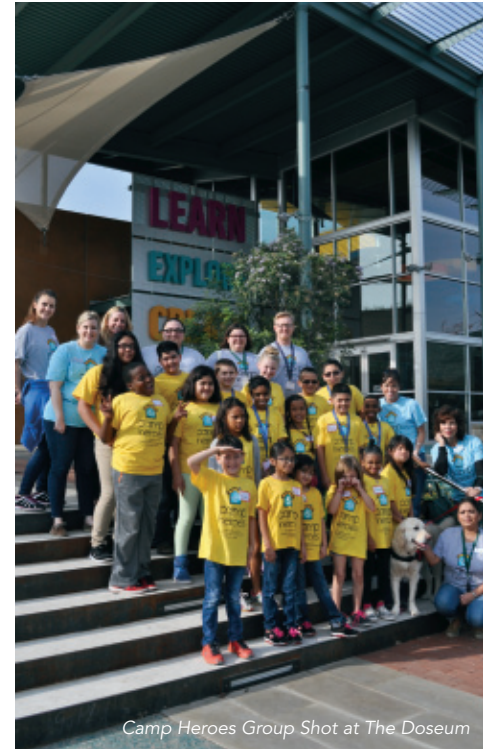
Camp Heroes Group Shot at The Doseum

"EVER SINCE SHE CAME BACK FROM THE CAMP, SHE'S BEEN MORE OPEN TO SHARING ABOUT HER LOSS AND THE PAIN SHE FEELS."